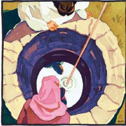
Jesus A well of living water For our lives

Text: Ruth C. Duck. Music: The Sacred Harp . Tune: BEACH SPRING