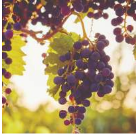
Labor and bear fruit in Christ