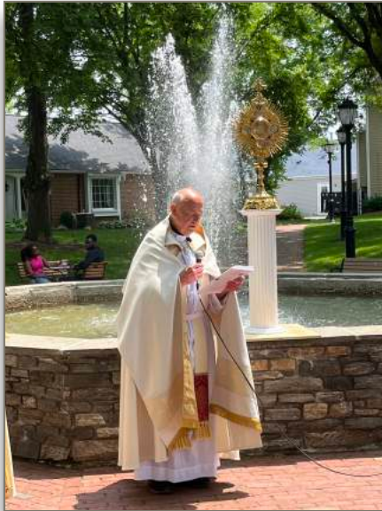
Corpus Christi procession June 2023