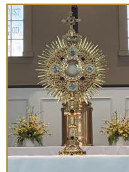
SS. Isidore and Maria Parish Solemn Monstrance

1. ev - ery side; Your aid sup - ply, your strength be - stow. 2. length of days, In our true na - tive land to be.