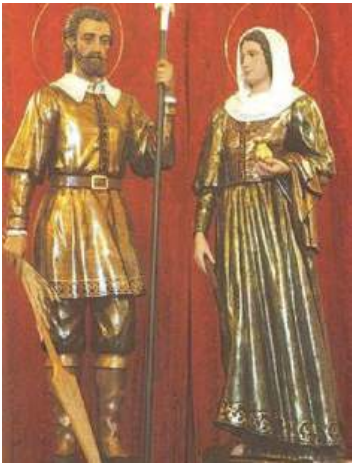
St. Isidore and St. Maria, sculptures of Real, Muy Ilustre Primitiva Congregación de San Isidro de Naturales de Madrid