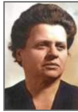
Vesta Stoudt

Vesta Stoudt (April 13, 1891 - May 9, 1966)