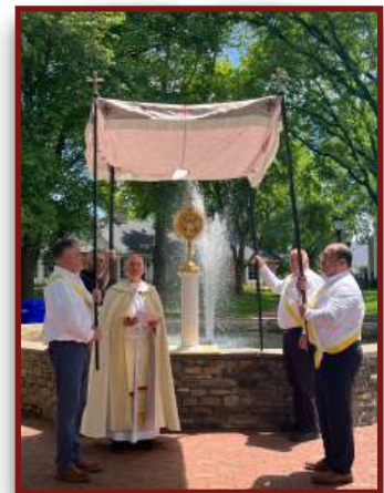
Coming June 22, 2025: Corpus Christi procession