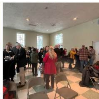
PHOTO GALLERY: Hospitality Weekend Jan. 2026 Were you spotted at the most recent Hospitality Weekend on Jan. 17/18? Here's a link to the full photo gallery, and be sure to get ready for our next Hospitality Weekend on Feb. 14 & 15! http://isidoreandmaria.org/hospitalityjan26