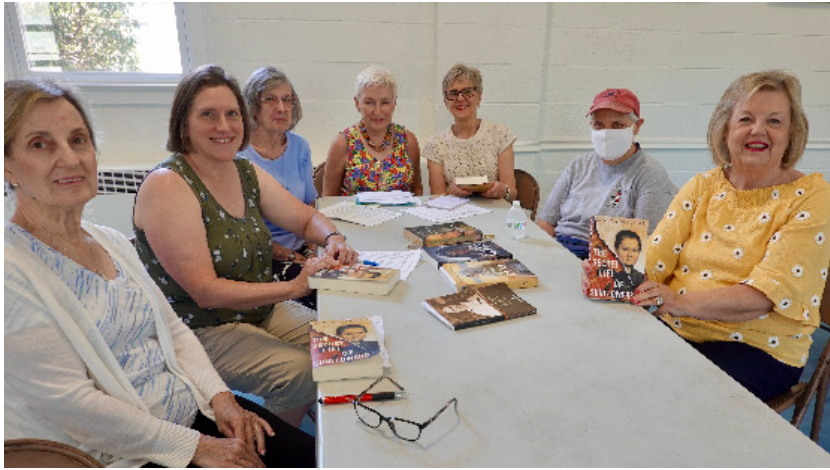
Some members of the Catholic book club at Holy Infant Parish in Orange gather at the church for their bimonthly discussion.